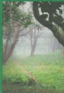
Trek route to the peak