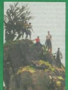
Fun on a rock